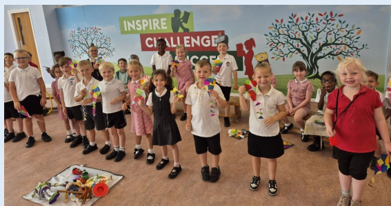
Willow Class Assembly- We love toys!