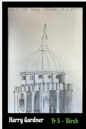
Harry Gardner Yr 5 - Birch

produced and children make brilliant progress compared to schools without this provision. This week the children have been developing their drawing skills which have included shading, continuous line drawing and use of charcoal, all linked to their class topic. Well done to the following children.